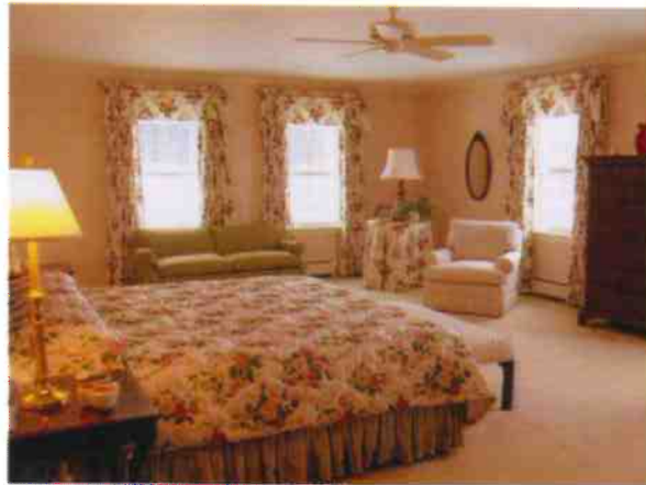
2nd Floor Guest Room