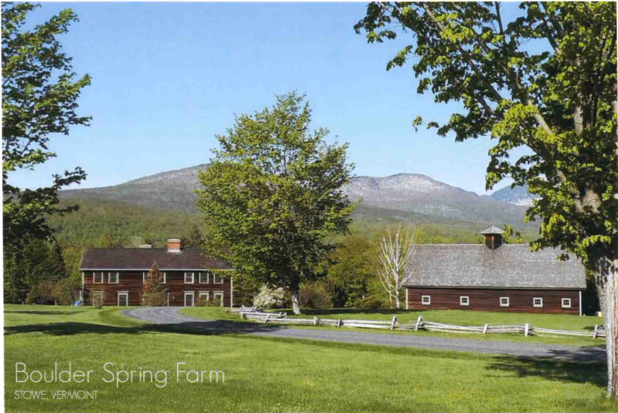
Boulder Spring Farm STOWE, VERMONT