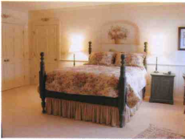
Main Floor Master Suite