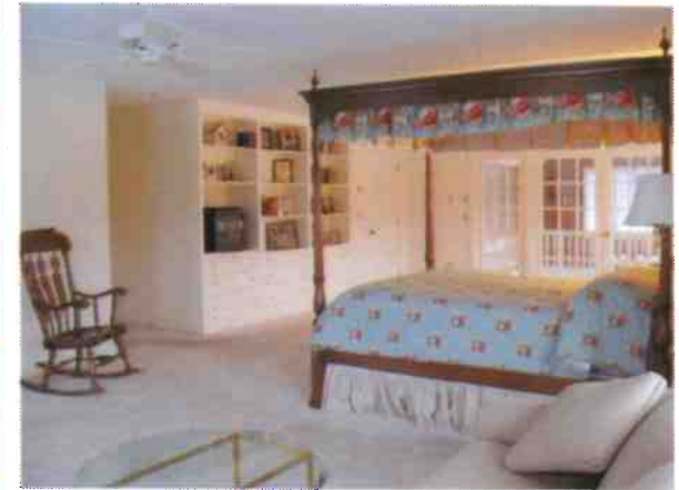
2nd Floor Master Suite

The main-floor master suite commands views on three sides where you can watch the sun and moon rise over the Worcester Mountains and set over Mt. Mansfield. There is another master suite and three guest rooms on the second story - each is a large canvas for the imagination.