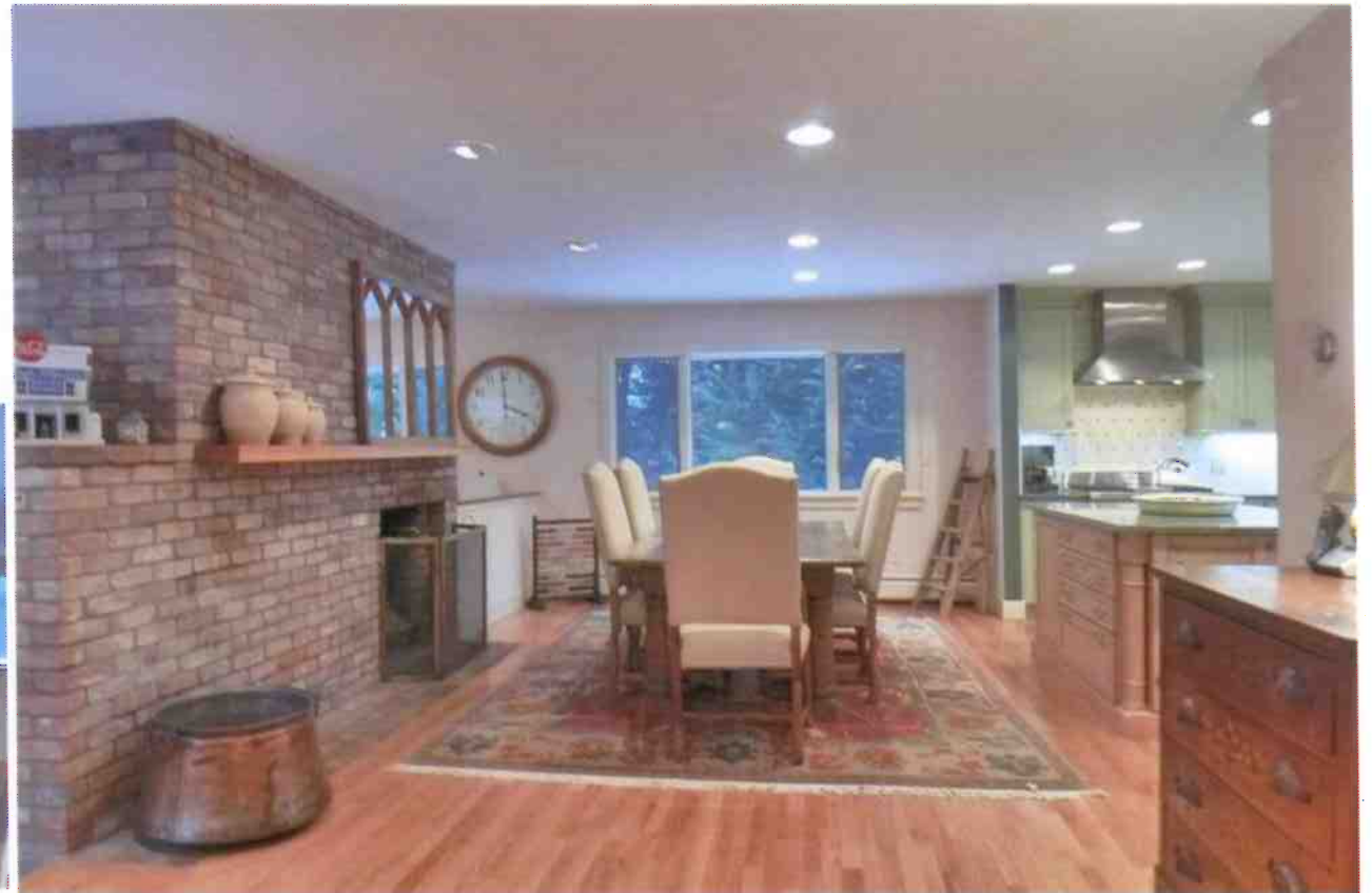
Dining Area with Wood-Burning Fireplace

The kitchen and dining areas flow seamlessly together, creating a delightful entertaining space.