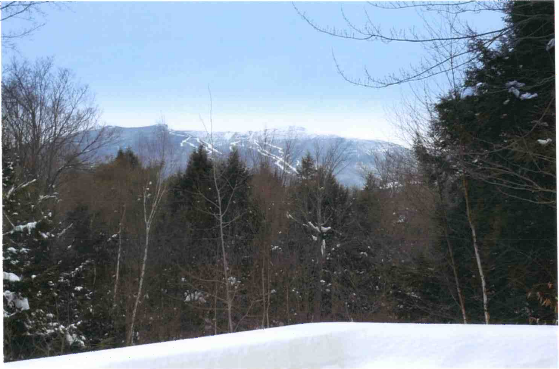
View From the Living Room Deck with Hot Tub.