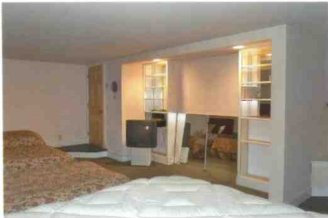
Lower Level Family Room