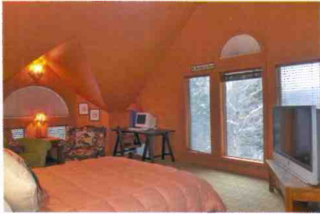
2nd Floor Guestrooms