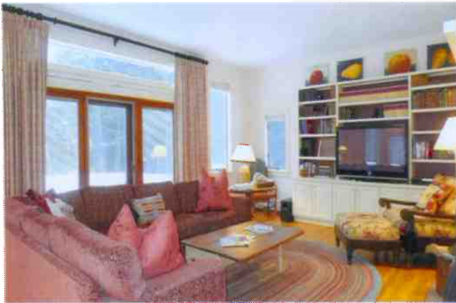
Sliding Doors to the Deck