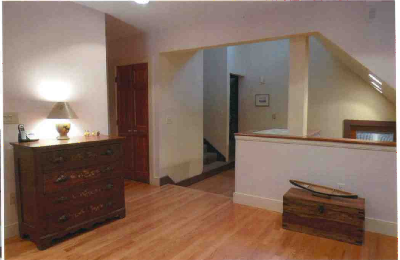
Main Hall opens to Main Living Area

The main stairwell entrances sets the tone for the easy flow of the home, with its clean lines and contemporary finishes. A large family room on the lower level offers extra space for family and friends.