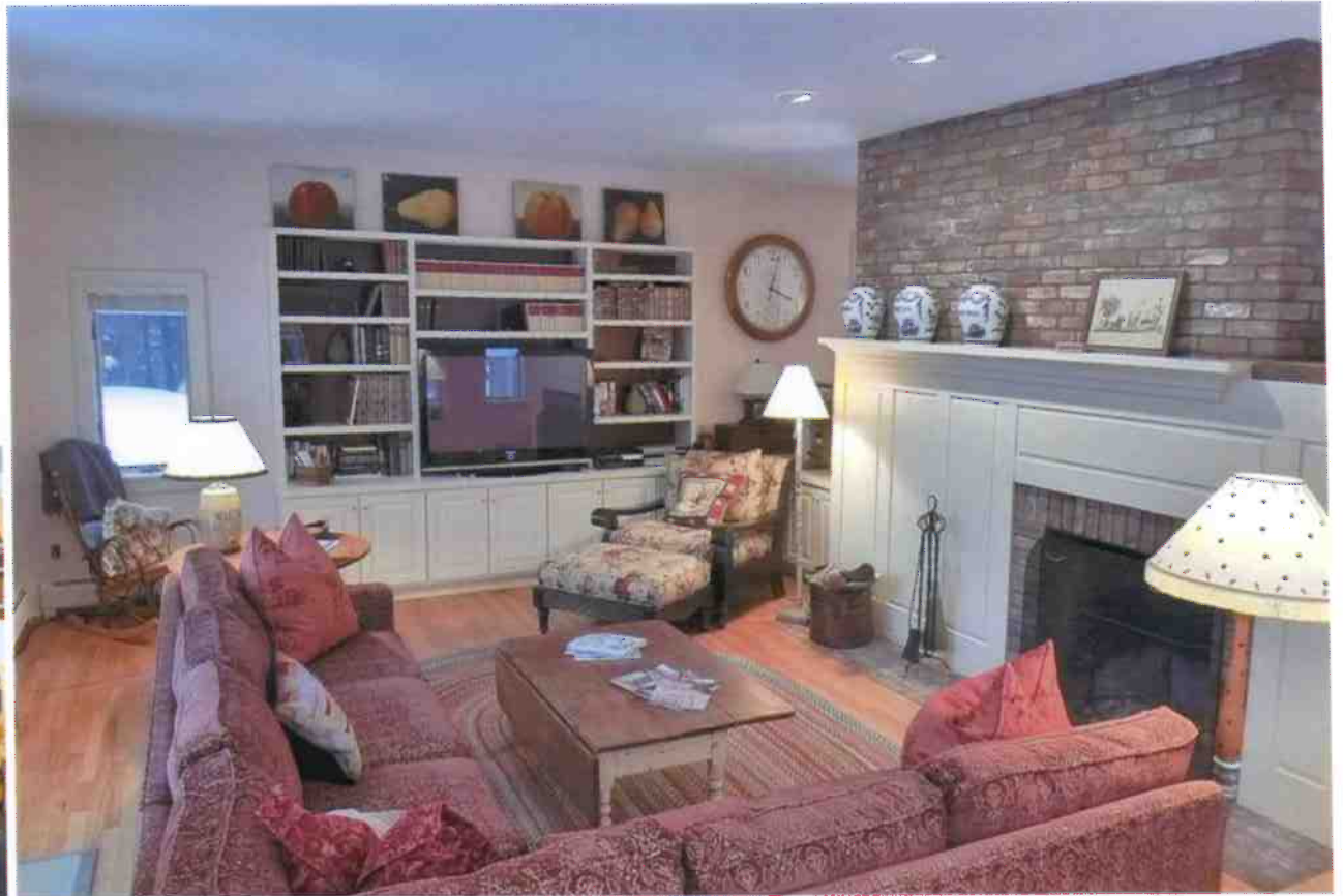
Living Room with Wood-Burning Fireplace

The comfortable and light-filled living room opens to a large deck with hot tub; interior features raised panel woodwork, hardwood floors, and a wood-burning fireplace.