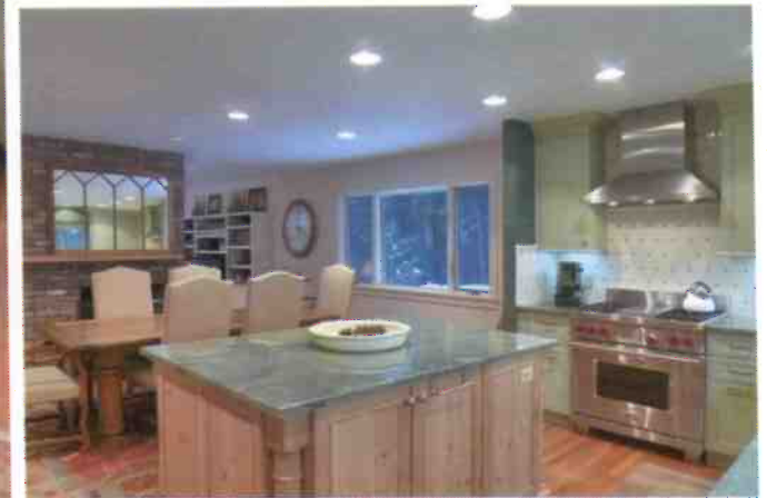
Open to Dining Room

Stainless steel appliances, Woodmode cabinetry, and granite countertops are a delight for the chef; an outdoor barbeque area is just outside.