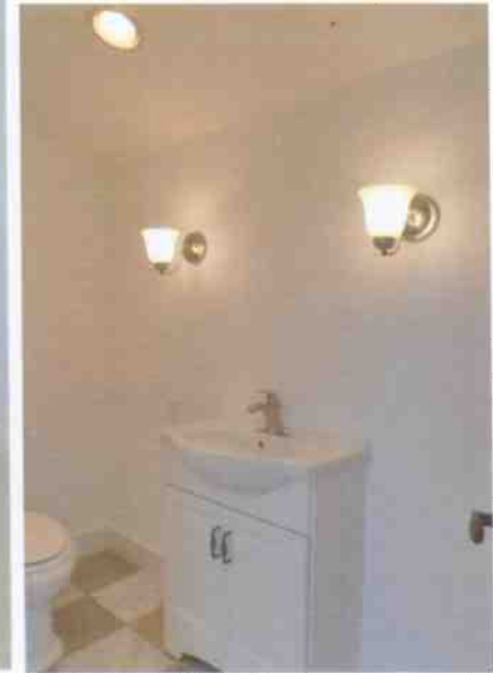
Family Room Bath with Shower

The spacious and light-filled family room with bath is located above the garage.