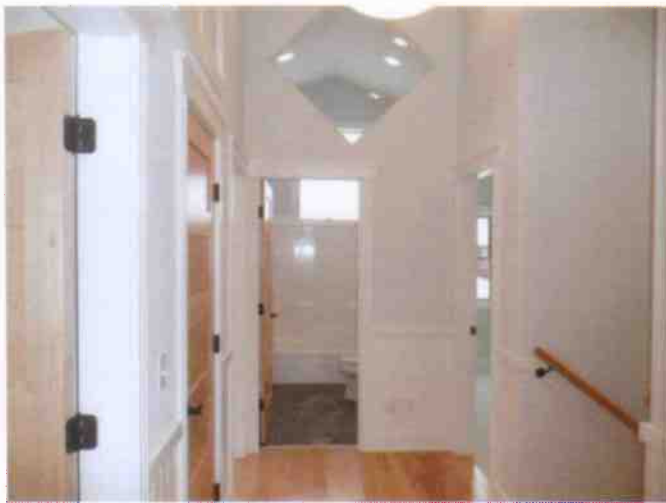
2nd Floor Hallway