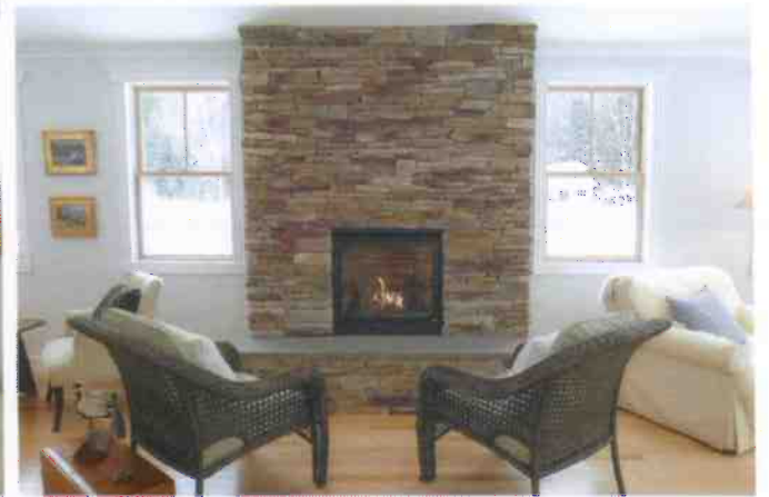
View From Dining Area

The living room is spacious, with generous daylight. Beautiful details include crown molding, radiantly heated maple floors, and a gas fieldstone fireplace.