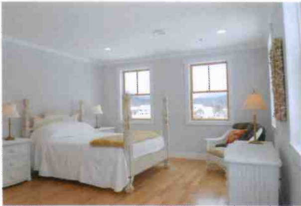
Main Floor Master Bedroom