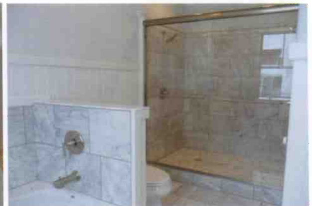
Master Tub and Shower

Luxurious touches in the main-floor master suite include a marble vanity, Jacuzzi tub, and dual head shower.