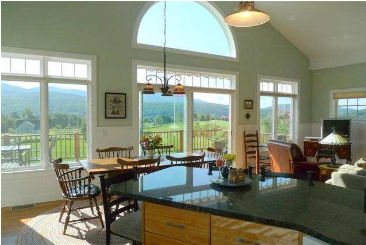
Stunning Mountain Views