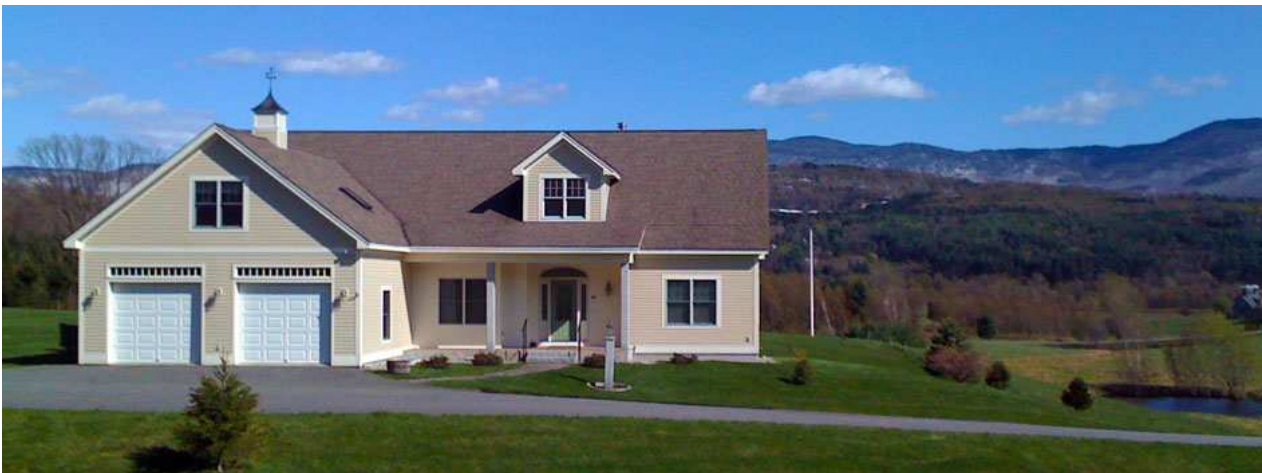
Front of Home