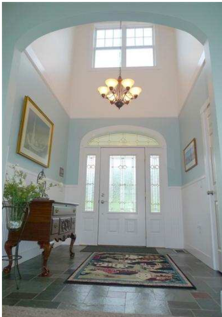
2 Story Entrance Foyer