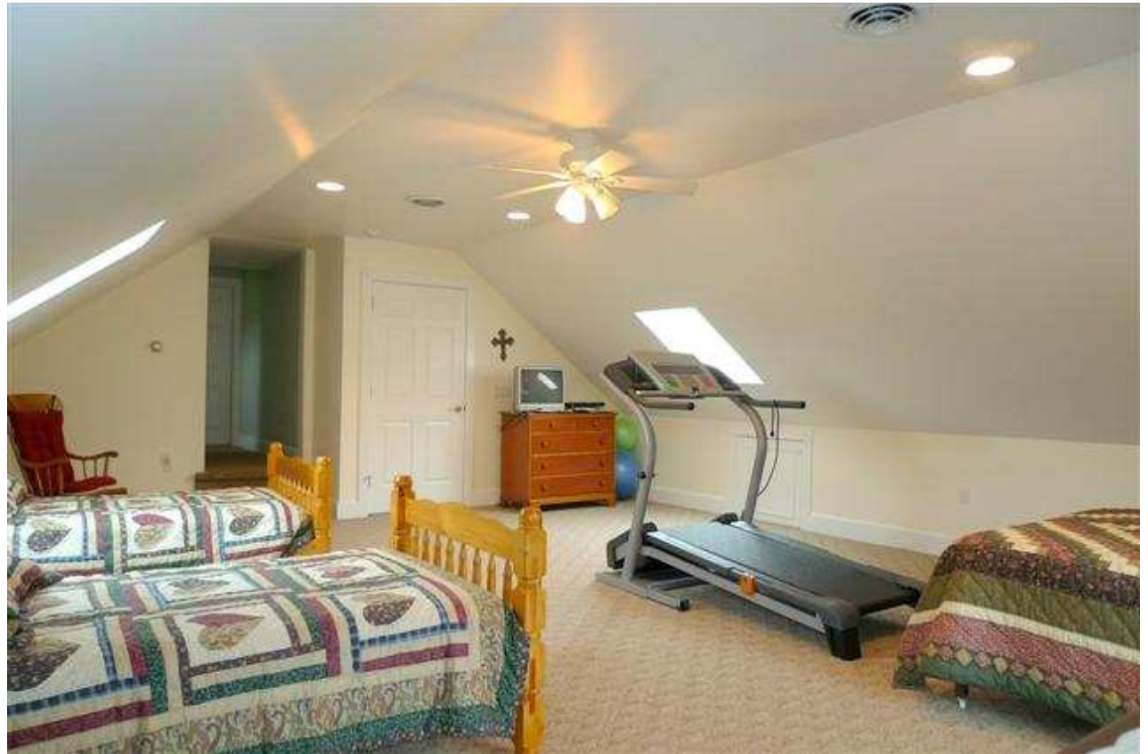
2nd Floor Bunk Room

The upper level bedroom/bunkroom is complete with a private bath.