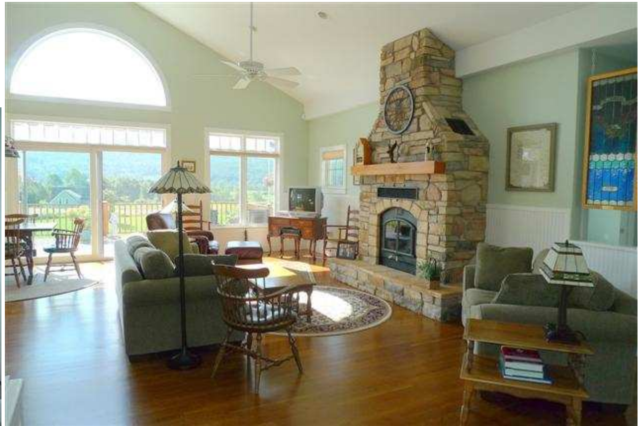
Great Room with Oak Flooring

A soaring entrance hall beckons you inside to the welcoming great room, anchored by a Vermont-craftsmen stone hearth fireplace. Southern exposure adds to the sunny warmth of this contemporary farmhouse.