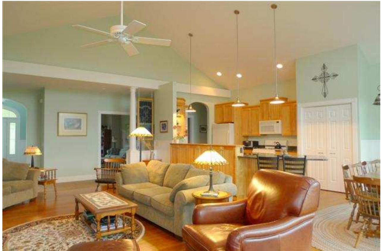
Great Room towards Kitchen

The great room is the heart of this home, with a dining area, kitchen, and a den all steps away. The den/office can also be used as a formal dining room.