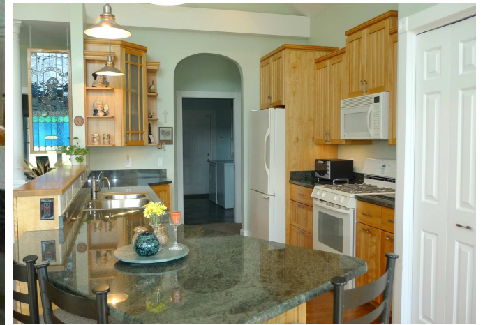
Spacious Galley-Style Kitchen

The kitchen opens to the great room, yet allows the views of the Worcester Range to take center stage. Modern appliances, red-birch cabinetry, and granite countertops combine for a pleasing aesthetic.