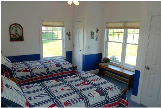
Main Floor Guest Room