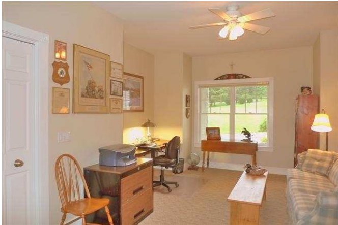
Den/Office - could be Formal Dining Room